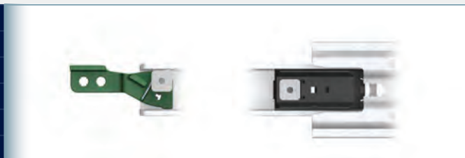
Lock-in and Lock-out