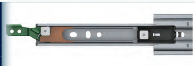
Lock-in/out Front release