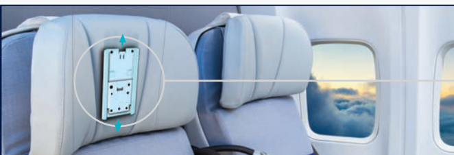
Aircraft head rests