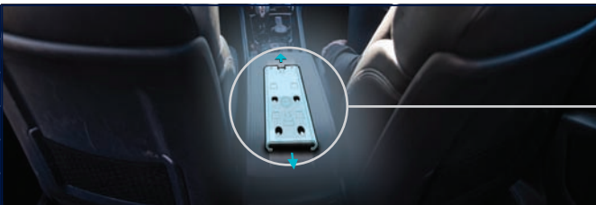
Mid consoles of personal cars

The main application of this Monte is armrest guidance in the automotive industry, but it is also well suited for other applications where constant force motion is required. Custom made slides can be produced with customer specific requirements in coating, length, extension, features and mounting possibilities.